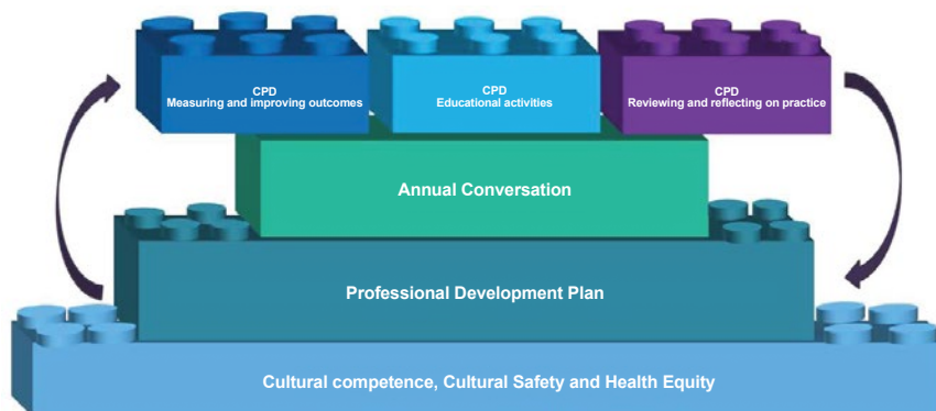
Figure 2. Interaction of CPD activities

The core components of the program interlink to provide a comprehensive CPD package which encourages practitioners to reflect on their practice and plan their activities according to their individual needs (Figure 2 courtesy of MCNZ).