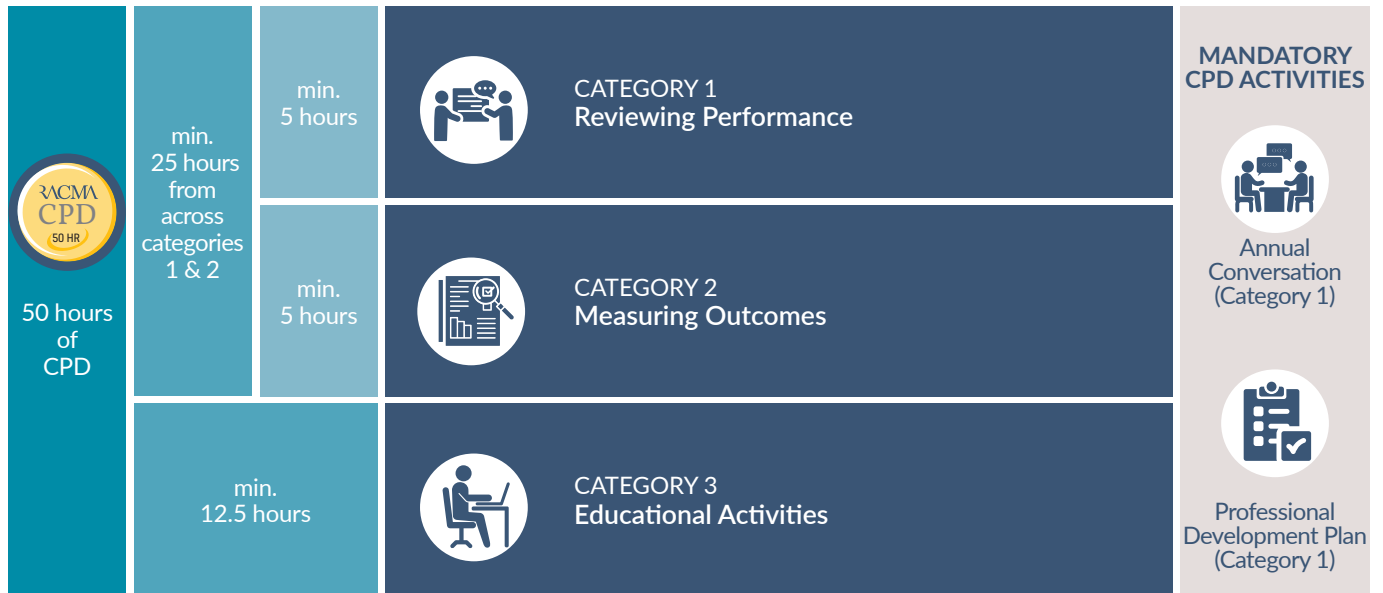
Figure 1. Minimum hours of CPD activities

The core components of the program interlink to provide a comprehensive CPD package which encourages practitioners to reflect on their practice and plan their activities according to their individual needs (Figure 2 courtesy of MCNZ).