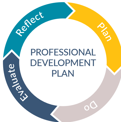
Figure 5. The PDP Cycle