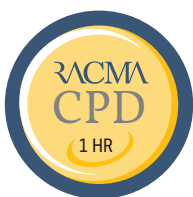
Figure 3. RACMA CPD Logo

Some activities organised by the College (e.g., Annual Conference, monthly Member webinars, etc.) will be automatically logged on behalf of Members. The CPD hours associated with each of these activities will be displayed on the program or promotional materials with the RACMA CPD logo shown below in Figure 3. The hours will relate to the relevant program.