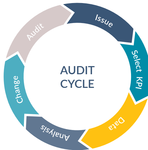
Figure 7: The Audit Cycle