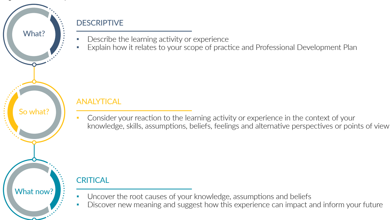
Figure 4. Reflective questions

There are many frameworks available to support reflective practice and lifelong learning and a useful toolkit can be found here . The following image highlights some of the questions to think about when writing a reflective statement in relation to your CPD activities.