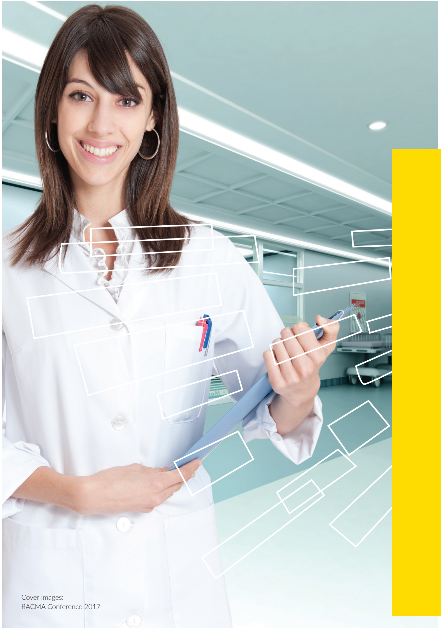
Cover images: RACMA Conference 2017