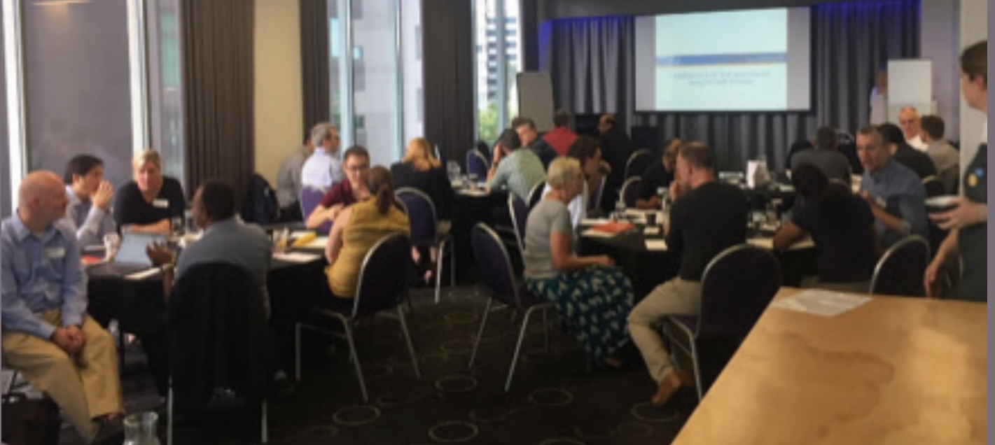
The Leadership for Clinicians Program attendees keenly working through some case studies.