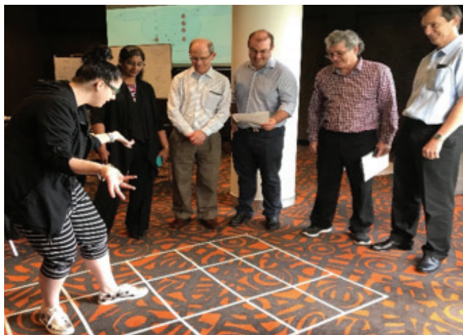
Team Skills to Survive Workplace Behaviour session.